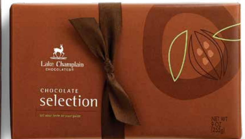
Selection 15 piece / 9 oz / 8 per case / Assorted A gift with something for everyone 1Y301-015001-1 7 69933 04602 7