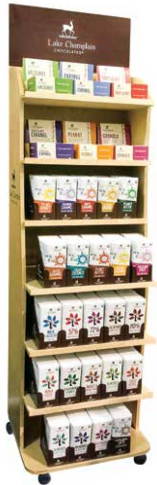
Bar Floor Display Some assembly required Holds 60 bar dispensers 16" w x 15" d x 65" h 1Y316-000022-1