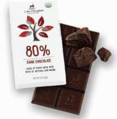
80% Dark Chocolate Organic Bar 80% Cocoa / Extra Dark Our darkest chocolate 1Y504-012112-1