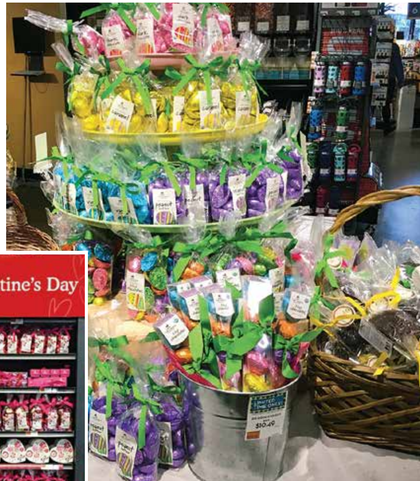
Maximize seasonal sales with timely displays that offer a wide assortment of products to suit every taste.