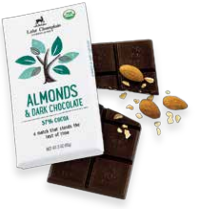
Almonds & Dark Chocolate Organic Bar 57% Cocoa A match that stands the test of time 1Y504-012115-1