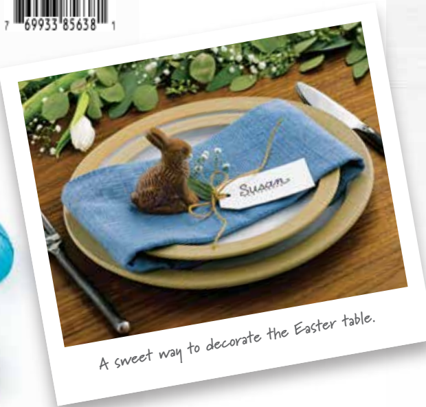
A sweet way to decorate the Easter table.