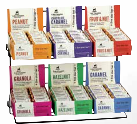
Wire Countertop Display / Fully assembled Holds 6 Five Star Bar® dispensers 16.25" w x 8.25" d x 13.25" h 1Y316-000021-1

All Five Star Bars® are packed in a 5" w x 6.25" d x 5.5" h dispenser box.