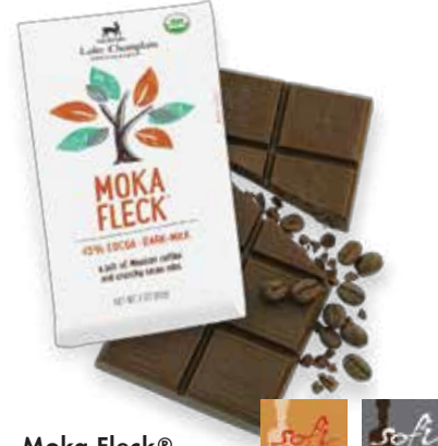
Moka Fleck® Organic Bar 43% Cocoa / Milk Bold Mexican coffee and crunchy cacao nibs 1Y504-012111-1