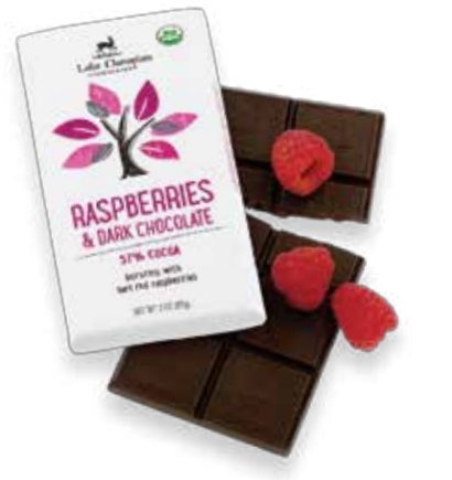
Raspberries & Dark Chocolate Organic Bar 57% Cocoa Bursting with tart red raspberries 1Y504-012110-1