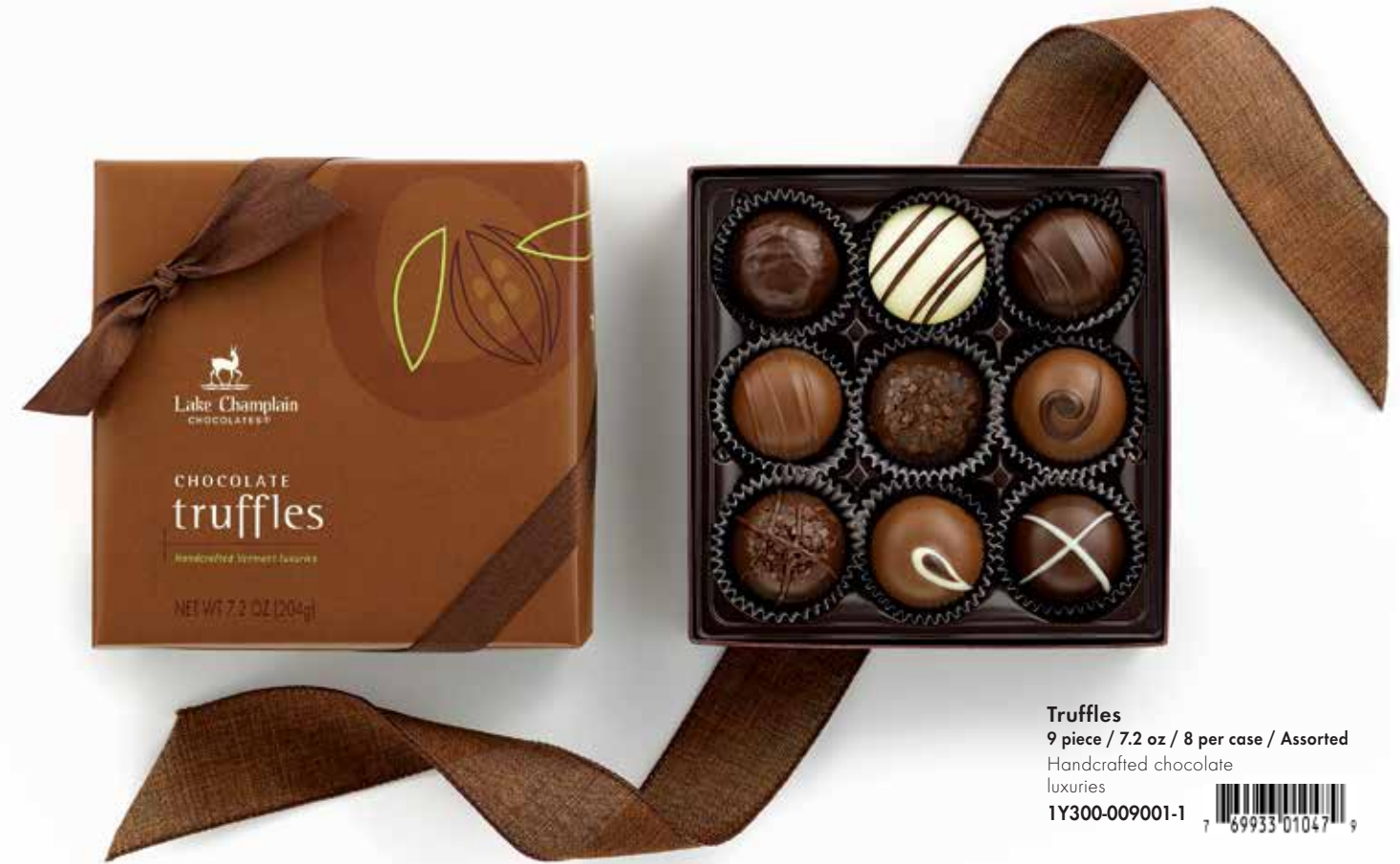
Truffles 9 piece / 7.2 oz / 8 per case / Assorted Handcrafted chocolate luxuries 1Y300-009001-1 7 69933 01047 9