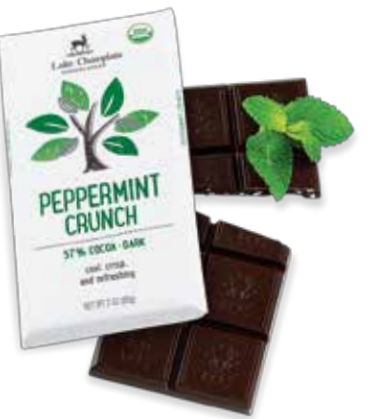
Peppermint Crunch Organic Bar 57% Cocoa / Dark Cool, crisp, and refreshing 1Y504-012114-1