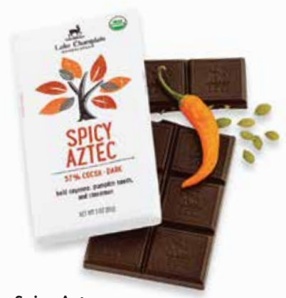
Spicy Aztec Organic Bar 57% Cocoa / Dark Bold cayenne pepper, pumpkin seeds, and cinnamon 1Y504-012104-1