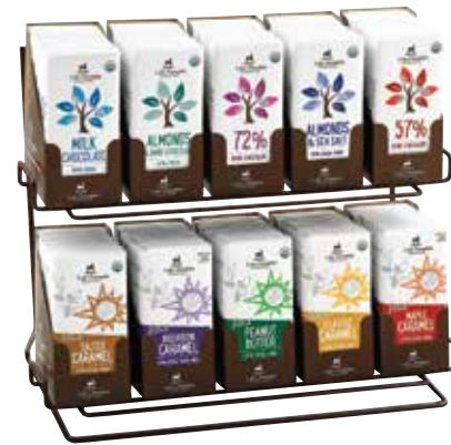
Wire Countertop Display Fully assembled Holds 10 chocolate bar dispensers 16.25" w x 8.25" d x 13.25" h 1Y316-000021-1