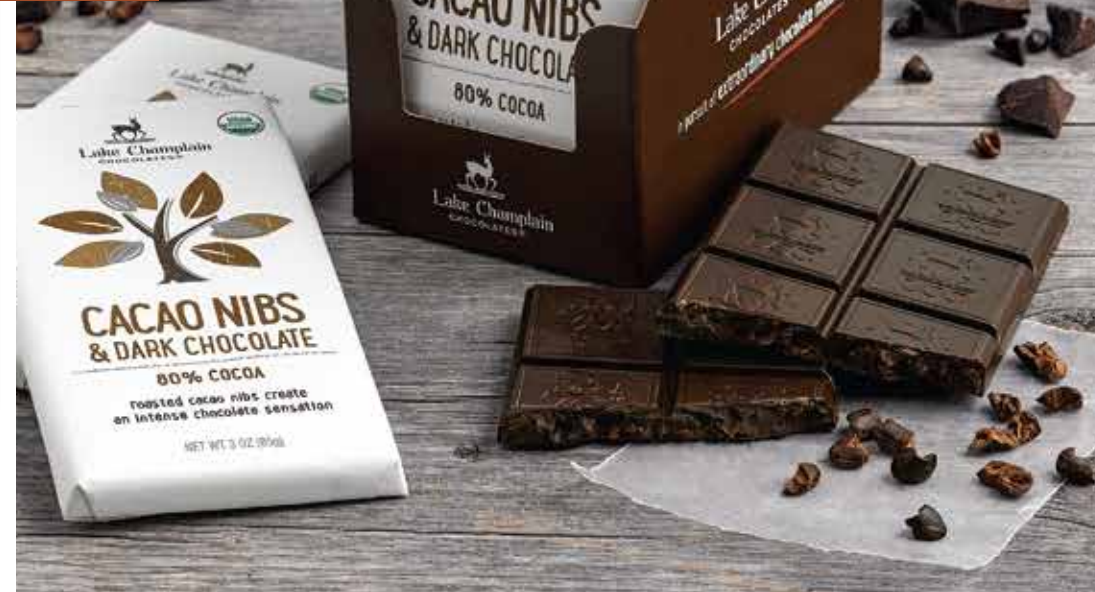
All bars are packed in a 2.9" w x 4.64" d x 5.9" h dispenser box.