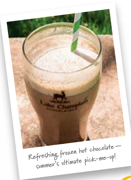
Refreshing frozen hot chocolate — summer's ultimate pick-me-up!

Help your customers explore extraordinary new ways to enjoy their organic and fair trade certified hot chocolate. Discover our frozen hot chocolate recipe and more at LakeChamplainChocolates.com/recipes and watch your hot chocolate sales heat up all year long.