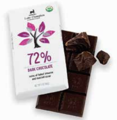
72% Dark Chocolate Organic Bar 72% Cocoa / Extra Dark Notes of baked brownie and roasted cocoa 1Y504-012107-1