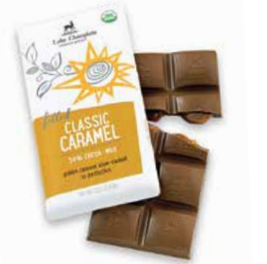
Classic Caramel Bar 38% Cocoa / Milk / S Golden caramel slow-cooked to perfection 1Y504-010010-1