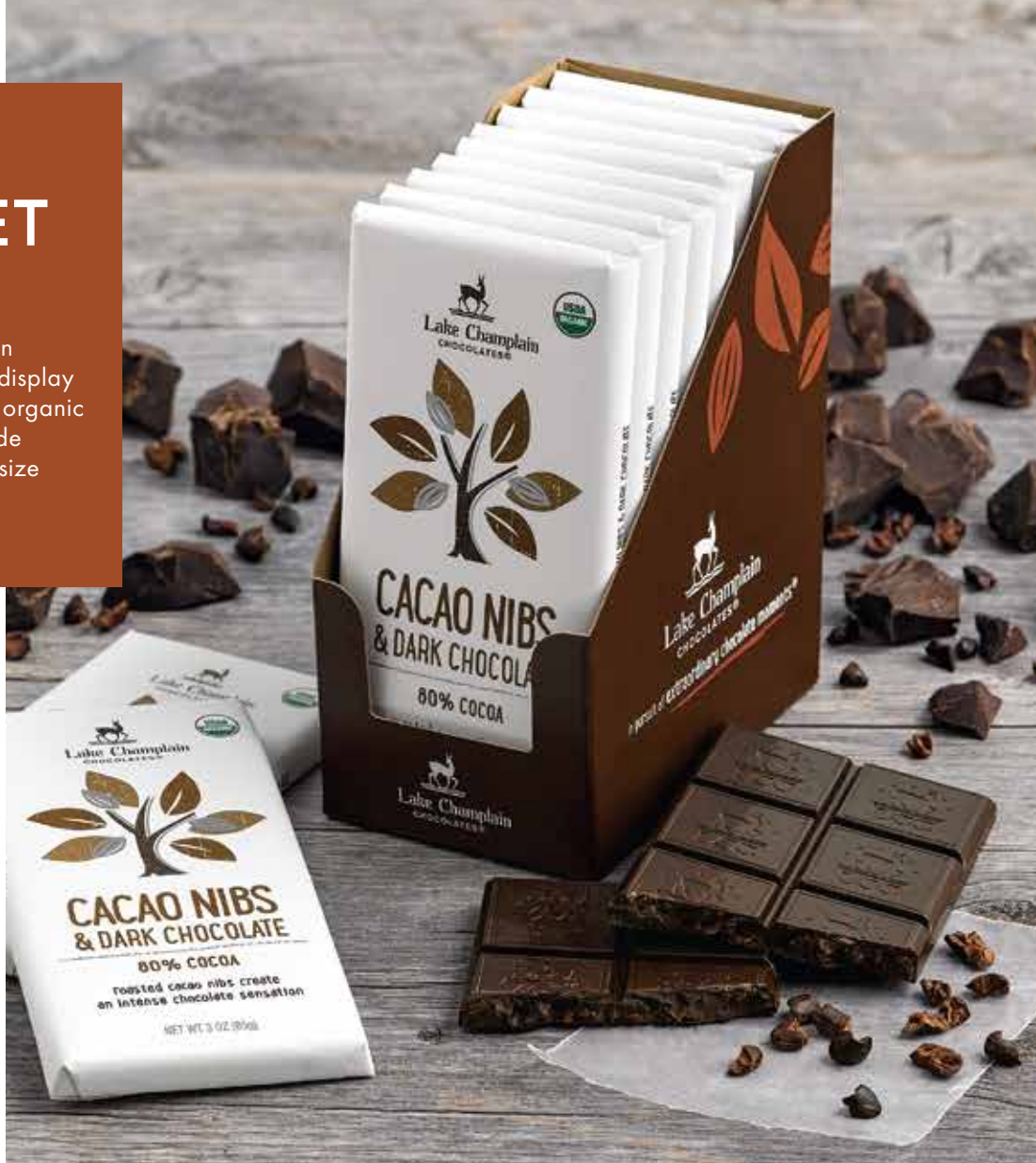
All bars are packed in a 2.9" w x 4.6" d x 5.9" h dispenser box.