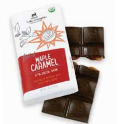
Maple Caramel Bar 57% Cocoa / Dark Sweet dessert caramel cradled in dark chocolate 1Y504-010011-1