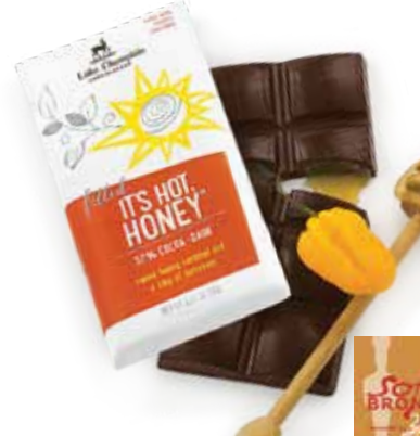
It's Hot, Honey® Bar 57% Cocoa / Dark Vermont honey caramel with a zing of habanero 1Y504-010006-1