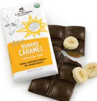
Banana Caramel Bar 57% Cocoa / Dark Creamy caramelized bananas – the ultimate dessert 1Y504-010008-1