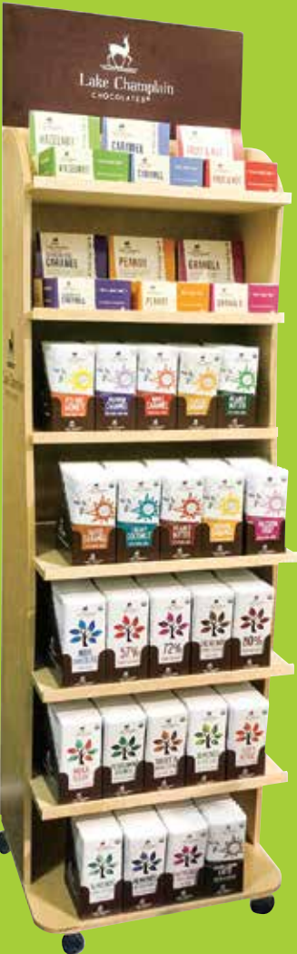
Bar Floor Display Some assembly required Holds 60 bar dispensers 16" w x 15" d x 65" h 1Y316-000022-1 Chocolate sold separately.