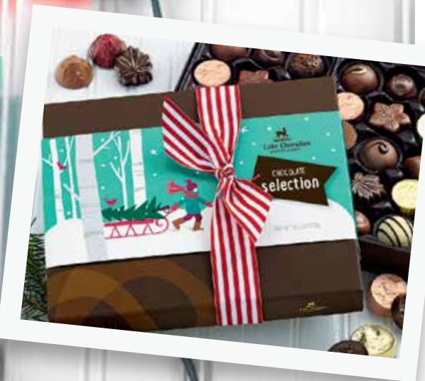
Holiday Selection 30 piece / 18.1 oz 6 per case / Assorted One gift to please them all 1X301-030001-1