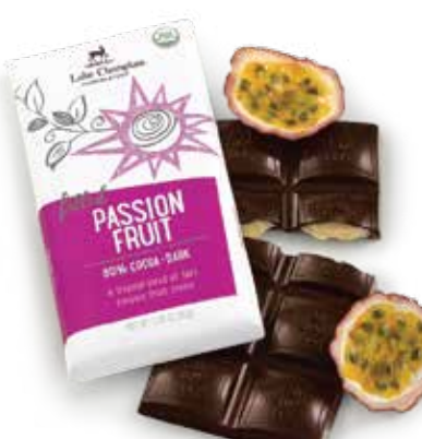
Passion Fruit Bar 80% Cocoa / Extra Dark A tropical blend of tart passion fruit cream 1Y504-010007-1