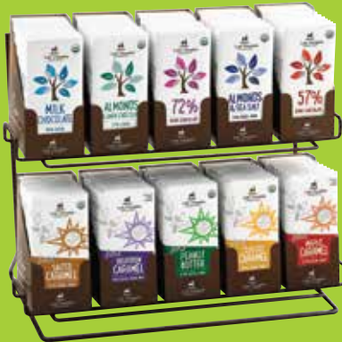
Wire Countertop Display Fully assembled Holds 10 chocolate bar dispensers 16.25" w x 8.25" d x 13.25" h 1Y316-000021-1 Chocolate sold separately.

Looking for a smart way to make more of your existing retail space? Place our attractive, compact, and freestanding displays where your customers will notice and boost your chocolate sales with impulse purchases!