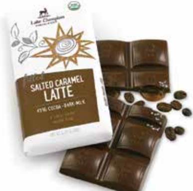
Salted Caramel Latte Bar 43% Cocoa / Milk / S A salty-sweet mocha treat 1Y504-010009-1