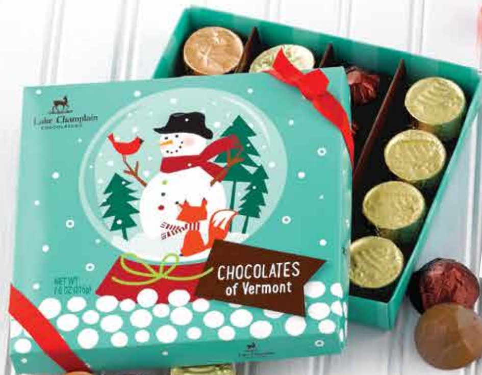
Holiday Chocolates of Vermont 16 piece / 7.6 oz / 8 per case / Assorted A legendary taste of Vermont 1X302-016001-1