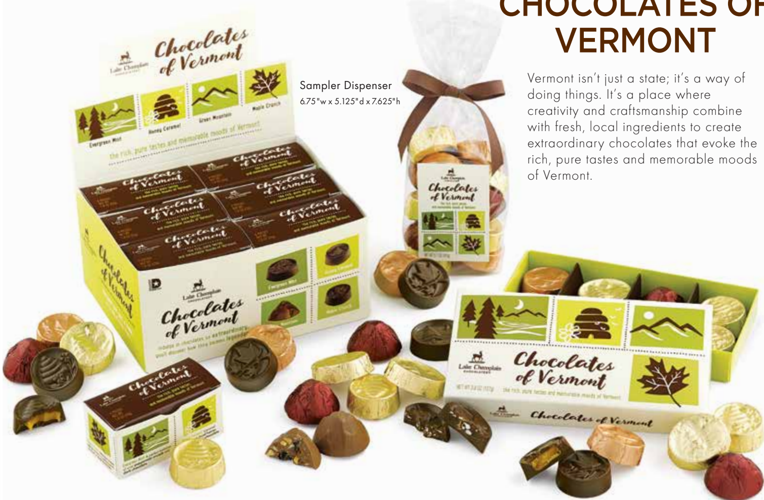
Sampler Dispenser 6.75" w x 5.125" d x 7.625" h

Vermont isn't just a state; it's a way of doing things. It's a place where creativity and craftsmanship combine with fresh, local ingredients to create extraordinary chocolates that evoke the rich, pure tastes and memorable moods of Vermont.