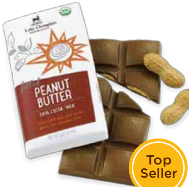
Milk Chocolate Peanut Butter Bar / 38% Cocoa Forget what you once knew about this timeless classic 1Y504-010001-1