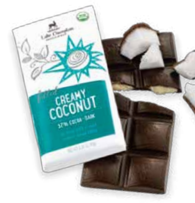
Creamy Coconut Bar 57% Cocoa / Dark Bursting with smooth coconut cream filling 1Y504-010002-1