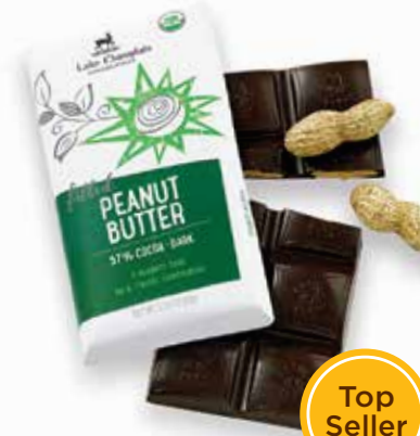
Dark Chocolate Peanut Butter Bar 57% Cocoa A modern take on a classic combination 1Y504-010004-1