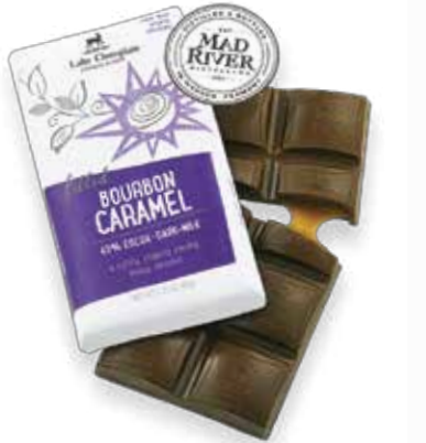
Bourbon Caramel Bar 43% Cocoa / Milk / S A sultry, slightly smoky, boozy caramel 1Y504-010005-1