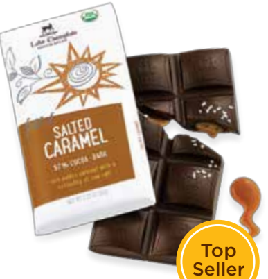
Salted Caramel Bar 57% Cocoa / Dark / S Rich, golden caramel with a sprinkling of sea salt 1Y504-010003-1