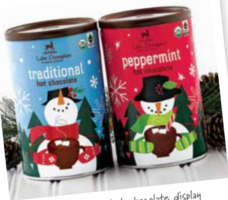
Complete your hot chocolate display with these seasonal favorites. See page 22.

There is something so deliciously satisfying about a warm mug of gourmet hot chocolate. Help your customers explore new ways to enjoy their favorite organic and Fair Trade Certified™ hot chocolate and watch your sales heat up! Explore our full collection of recipes at LakeChamplainChocolates.com/recipes .